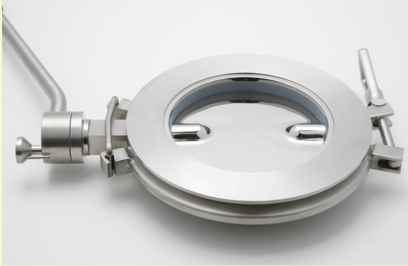
CORA Model CV Valve shown with manual operating lever

For intercepting the flow of powders or granulates