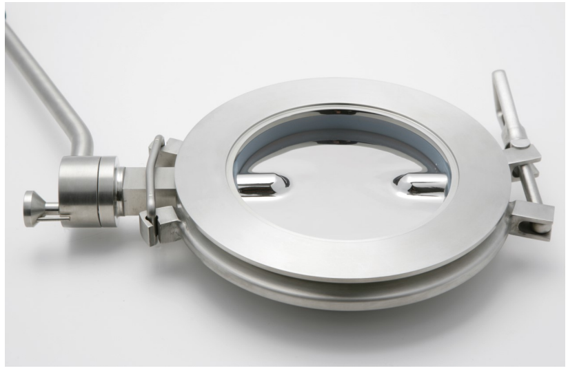
CORA Model CV Valve shown with manual operating lever

For intercepting the flow of powders or granulates