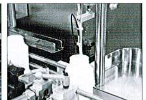
Cotton inserted verification and reject