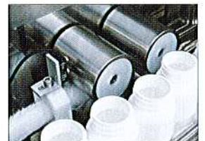
Cotton feed by continuous turning rollers