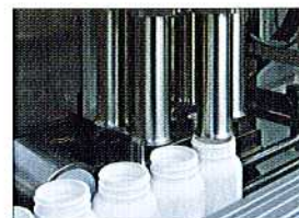
Swivel tube cotton insertion