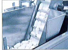
Bulk hopper with level sensor and variable speed feeding elevator