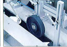
Bottle direction alignment hooker and bump roller. Side belt width and height adjustable