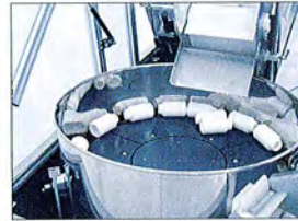
Level sensing disc sorter