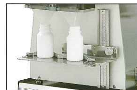
Adjustable container platform