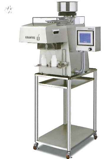
Portable tray is optional item