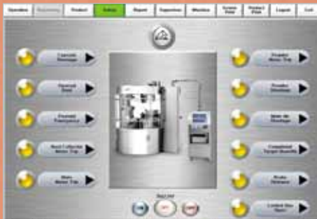
Safety Message Function