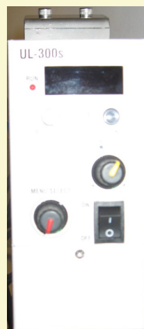
Vibration Speed Control 110 Volts / Single Phase